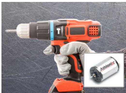
Figure 3: Coreless DC motors ensure reliable, efficient operation of battery-operated power tools

Defining thermal efficiency, the motor regulation parameter (R/k2) shows the capability of converting the electrical input to mechanical power and helps define heat losses. Higher thermal efficiency is critical for applications such as battery-operated devices, which can impact footprint size and weight, as well as required heat dissipation techniques.